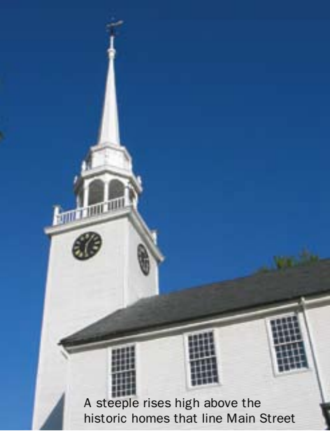
A steeple rises high above the historic homes that line Main Street

SOMERSBY is located in historic Farmington, Connecticut, a town that has so much to offer.