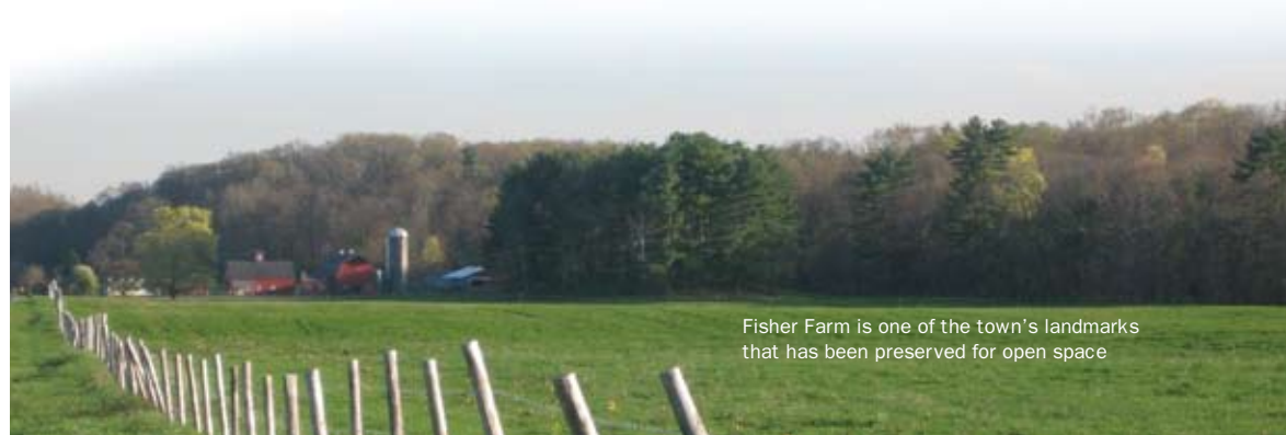
Fisher Farm is one of the town's landmarks that has been preserved for open space