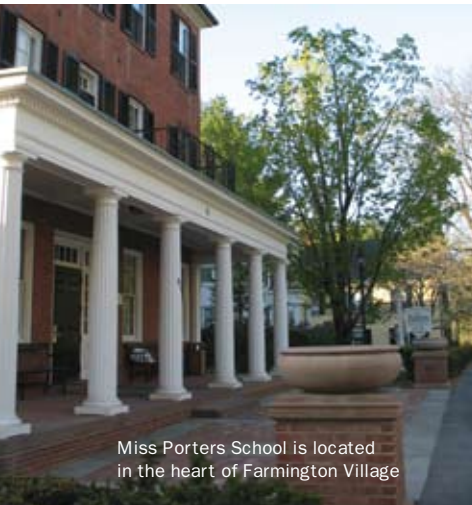
Miss Porters School is located in the heart of Farmington Village