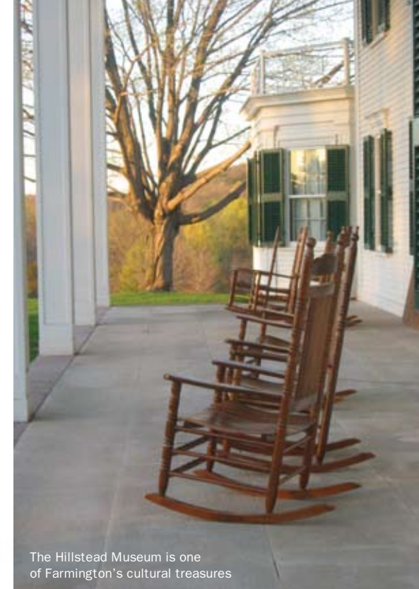
The Hillstead Museum is one of Farmington's cultural treasures