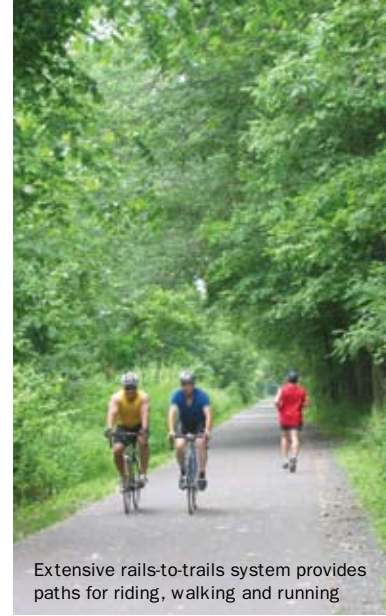
Extensive rails-to-trails system provides paths for riding, walking and running