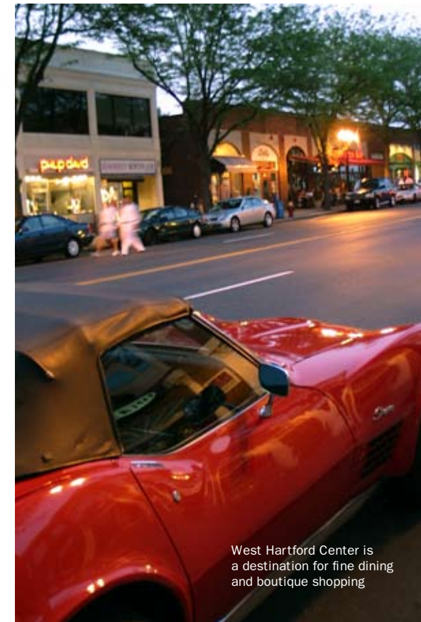
West Hartford Center is a destination for fine dining and boutique shopping